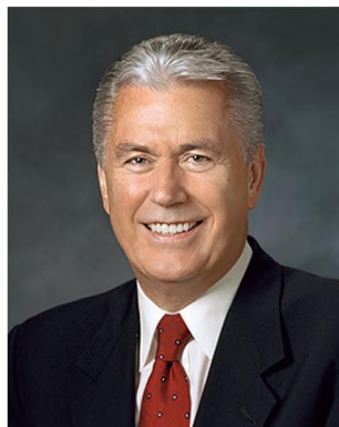
Dieter F. Uchtdorf