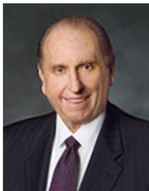
Thomas S. Monson

When the Prophet and Apostles speak to us it is important we listen. Write down two things you learn from each speaker.